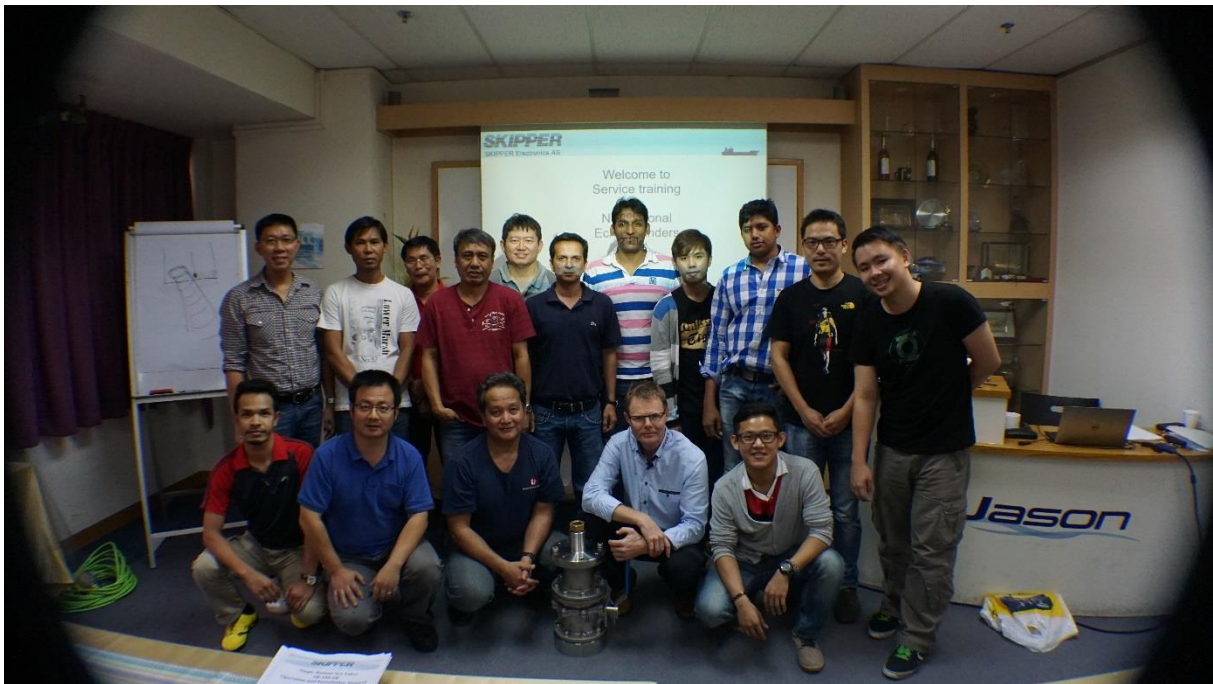
Picture from SKIPPER training in Singapore October 2015.

Totally 29 people from the following companies attended the trainings