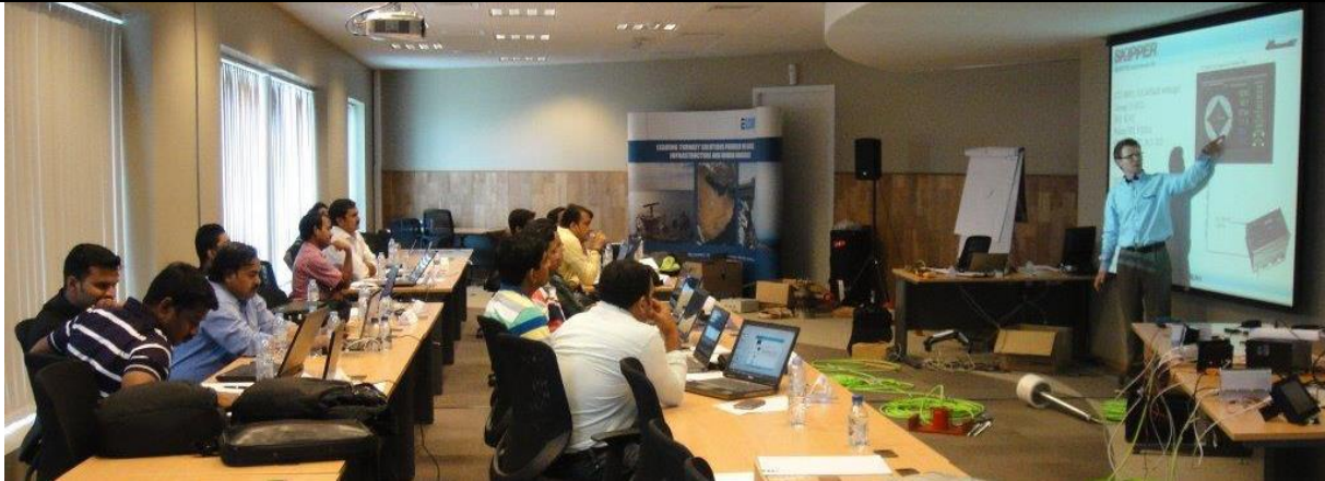
Picture from the successful SKIPPER training in Dubai 8 th . – 10 th . September.